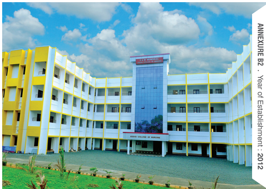
ANNEXURE B2 . Year of Establishment : 2012

3 km - KSRTC & Private Bus Stand, Erumely